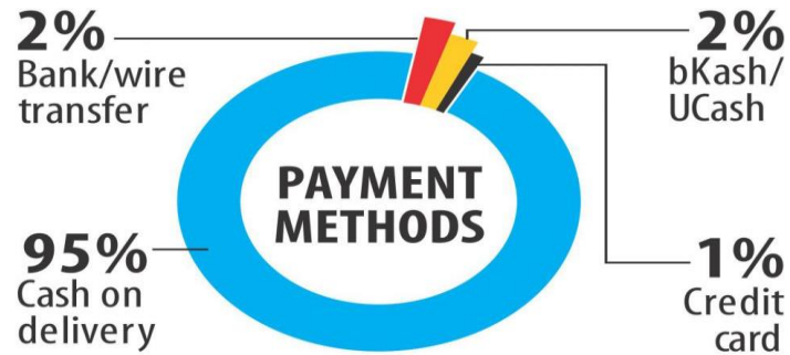
Table: 3 Payment Methods.

According to statistics, Bangladesh is ranked 47th in the world for e-commerce. However, 90 percent of product transactions are cash, which is unfortunate. Since the order was made digitally, the owner of the page calls to confirm it. The consumer receives the items from the e-commerce business, which takes cash. In that case, by inference complete e-commerce has yet to be introduced in Bangladesh.