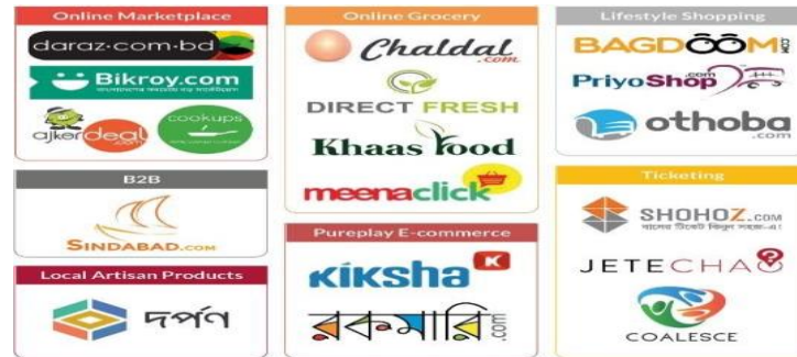
Table: 1 E-commerce platforms of Bangladesh

now operating and performing admirably alongside foreign firms. Amazon has recently established a presence in Bangladesh and is conducting business there.