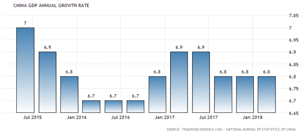
Figure 1: China GDP Annual Growth Rate from 2015 to 2018