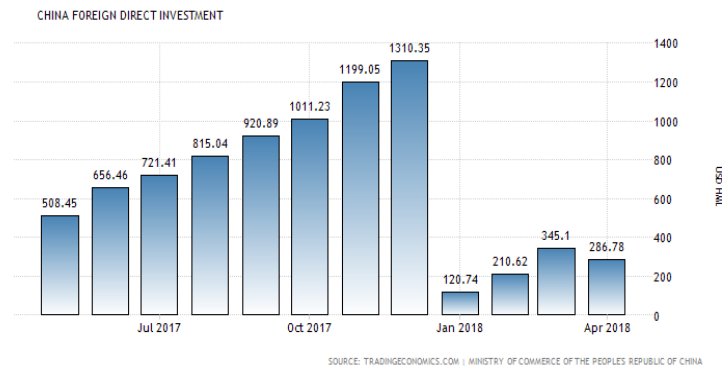
Figure 3: China Foreign Direct Investment from 2017 to 2018